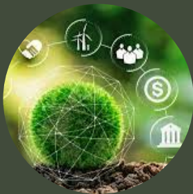
Compliance with Environmental Regulations

The primary purpose of an ETP is to remove harmful pollutants and contaminants from the industrial effluents.