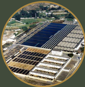
Drinking Water Supply

These plants play a crucial role in ensuring access to clean and safe water for communities, industries, and agriculture.