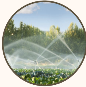
Agricultural Wastewater Treatment