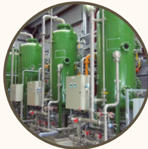
Boiler feed water treatment