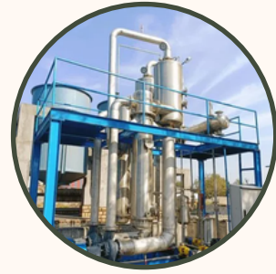
Chemical and Pharmaceutical Industry