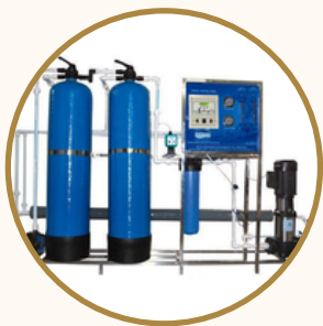
Drinking Water Purification

Is a process that involves applying pressure to a concentrated solution to force the passage of water through a semipermeable membrane.