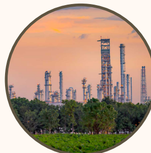
Oil and gas industry