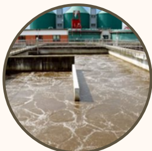
Municipal wastewater treatment

This process involves advanced treatment technologies to achieve a high level of water recovery, resulting in minimal or zero liquid waste being discharged from the plant.