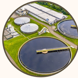
Municipal Wastewater Treatment