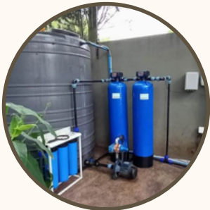
Residential and commercial water supply

This process involves exchanging the calcium and magnesium ions with sodium or potassium ions, resulting in softened water that is less likely to cause scale buildup.