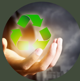
Reuse and Recycling