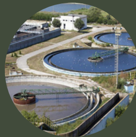
Protection of Water Resources