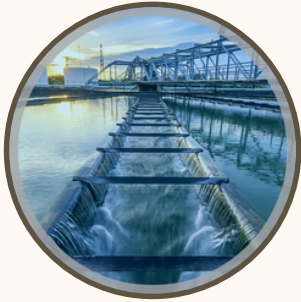
Industrial Wastewater Treatment

The primary objective of an STP is to remove contaminants and pollutants from the wastewater before it is discharged back into the environment.